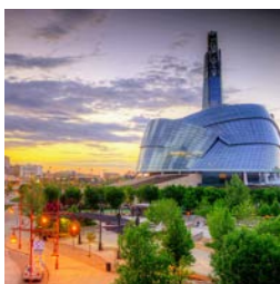
WINNIPEG, MB SEP. 18 - 21, 2017