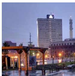
MONCTON, NB NOV. 27 - 30, 2017