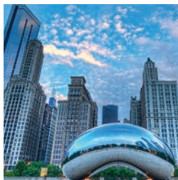
CHICAGO, IL NOV. 13 - 16, 2017