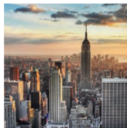
NEW YORK, NY DEC. 4 - 7, 2017